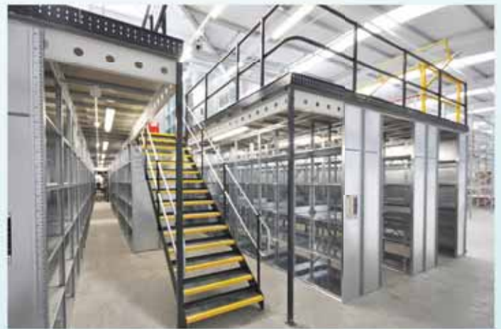
Shelving with Two Tier Mezzanine