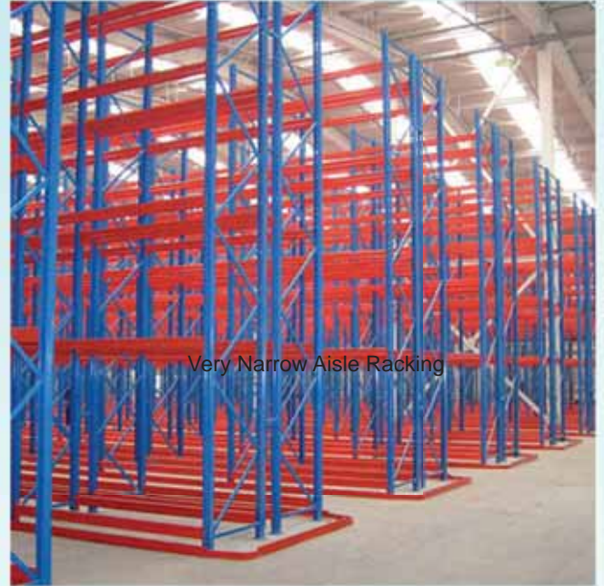
Very Narrow Aisle Racking