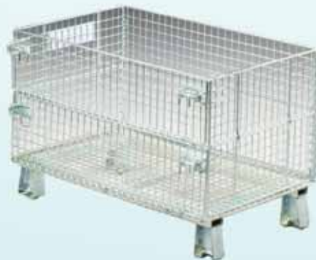
Foldable Mesh Container