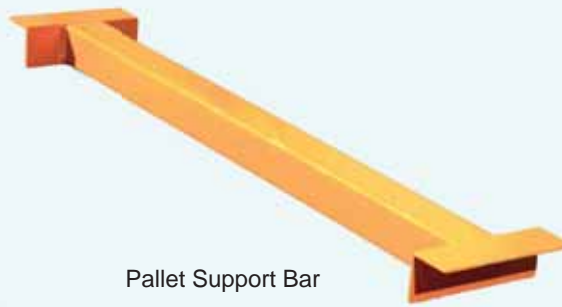
Pallet Support Bar