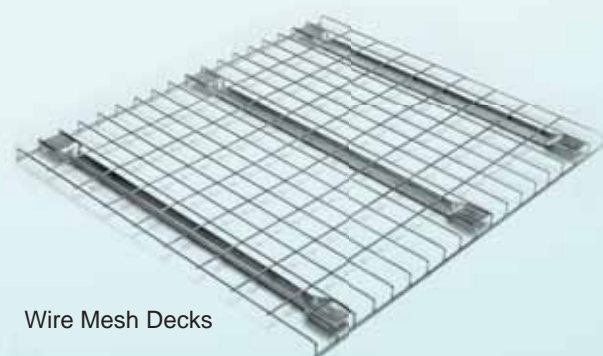
Wire Mesh Decks

Al Khalaf is one of the leading companies in the storage systems market specializing in the design, manufacturing, sales and services of metal racking, automated warehouses and other storage solutions. Al Khalaf Racking Division established to provide support and advice to organizations requiring a complete range of storage products to be either supplied or installed. These products include; Adjustable Pallet Racks, Drive-in Racks, Mobile Racks, Cantilever Racks, Long Span Storage Systems, Multi-Tier Shelving, Mobile Shelving / Compactor, Plastic Bins, Slotted Angles, Mezzanine, Super Market Racks.