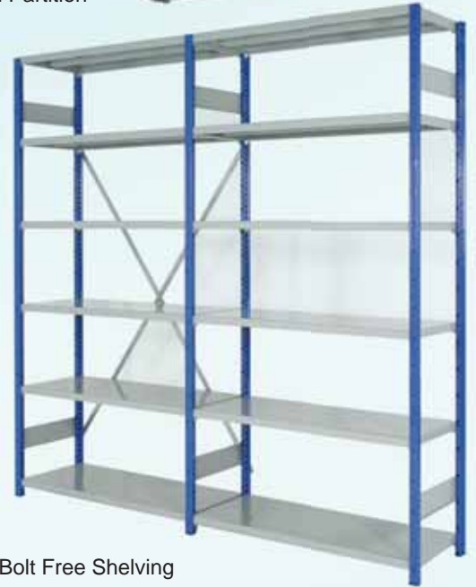
Bolt Free Shelving