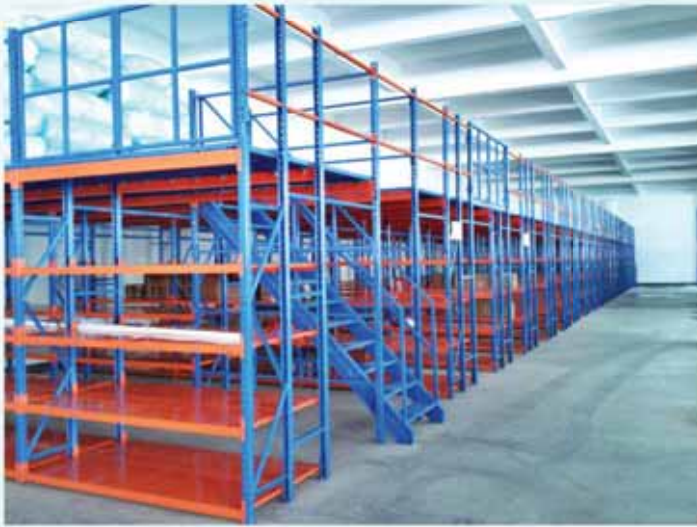
Open Plank Flooring