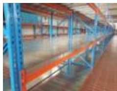
GI Sheet Decking