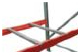
Pallet Support Bar